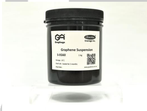
1kg/Plastic jar Φ:~12cm Height: ~14.5cm